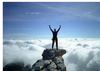
“And he spake a parable unto them to this end, that men ought always to pray, and not to faint;” (Luke 18:1)

from God's Word, the things which our Righteous God demands from us when we pray! If we offer these things to Him whenever we pray, our prayers will be righteous in His sight and will also avail much! (James 5:16). The following are basic scriptural requirements for guaranteed-answered-